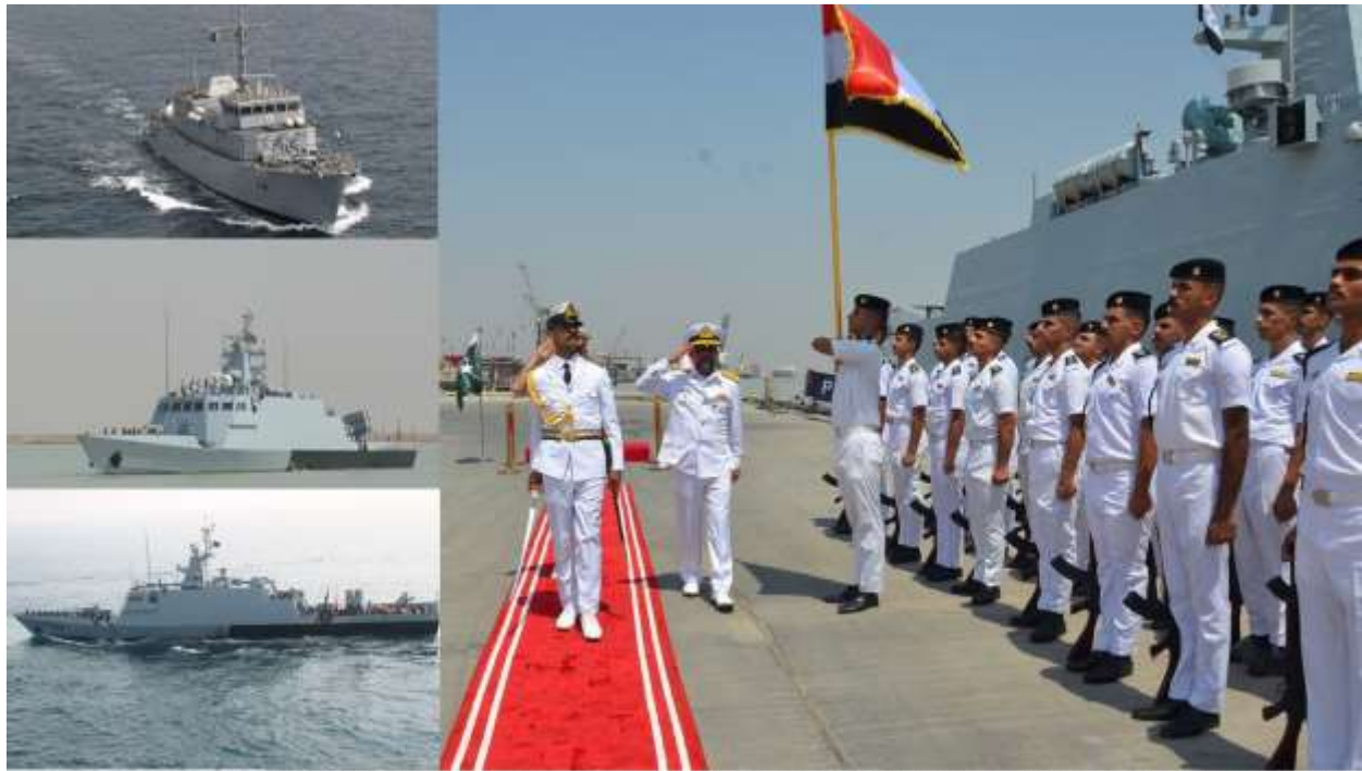
PN Mission Commander reviewing Guard of Honor during Pakistan Navy Flotilla visit to Port Umm Qasr, Iraq