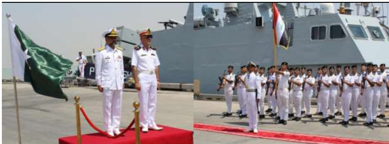
Mission Commander PN Flotilla being presented salutation by Iraqi Navy during PN Flotilla visit to Iraq