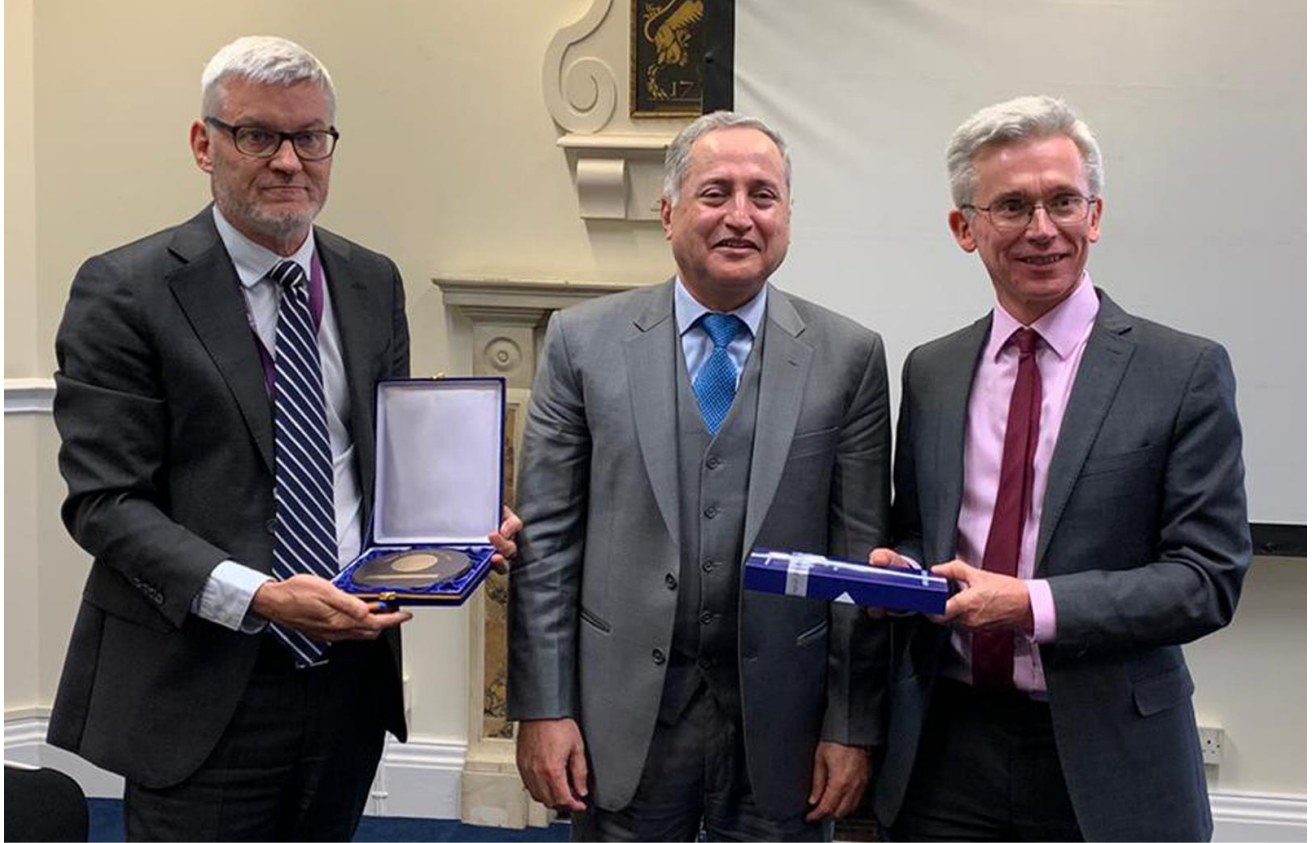
Chief of the Naval Staff, Admiral Zafar Mahmood Abbasi at British Think Tank, Royal United Services Institute (RUSI) during his official visit to United Kingdom